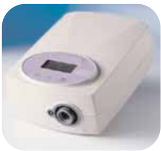
GoodKnight 420E Auto-CPAP

The Puritan Bennett GoodKnight 420 CPAP System now includes the 420E Auto-CPAP model, so patients who require auto-CPAP therapy can enjoy the advantages of the world's smallest, lightest system.