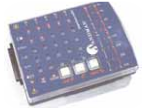
SD32+ Impedance Meter

Low impedance values are important in the preparation of a patient study to ensure superior signal quality during a sleep study. Puritan Bennett now provides an optional external Impedance Meter which provides an instant check of electrode impedance and comparison of all channels during a patient hook-up. The best feature of this device is that it interfaces directly to the Sandman Digital 32+ headbox, saving preparation time by eliminating the need for the Polysomnographic Technologist to start the computer software to run the impedance test. It can now be done from the patient prep room.