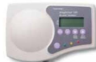
KnightStar 330 Bi-Level and Sandman elink ethernet connection box

Beta trials for v.7.1 software will continue for the next 60 days, with a targeted Spring release date to be announced.